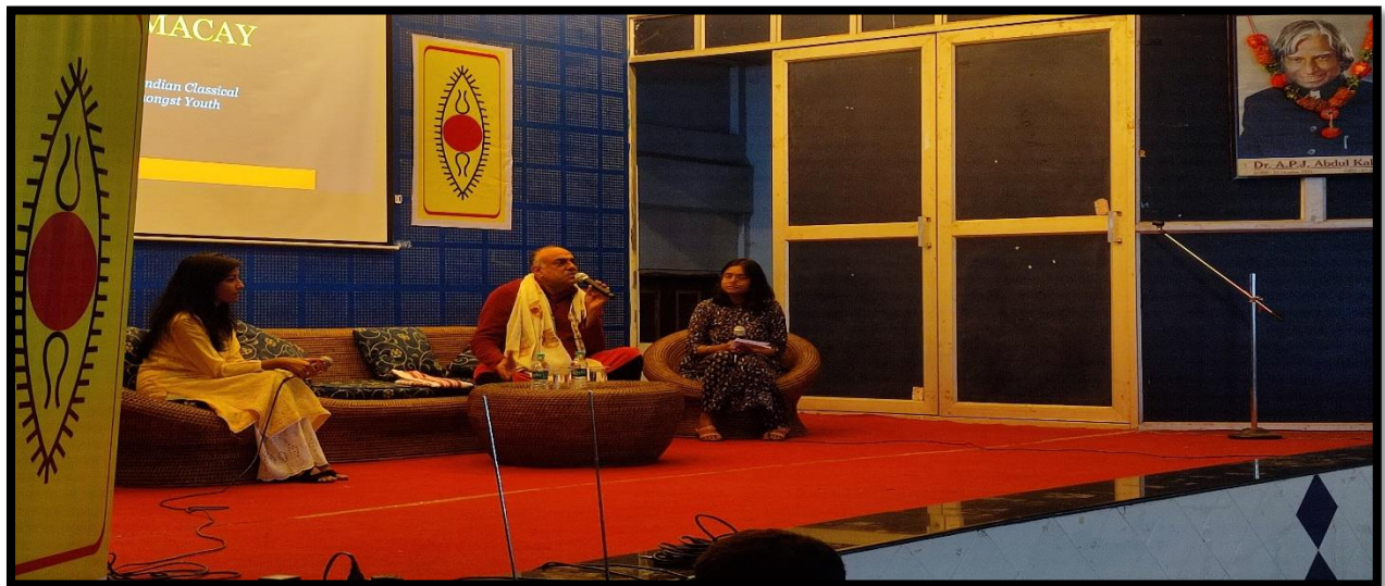
Hosts for the evening in conversation with Shri Rajit Kapur