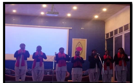
Students singing Raghupati Raghav