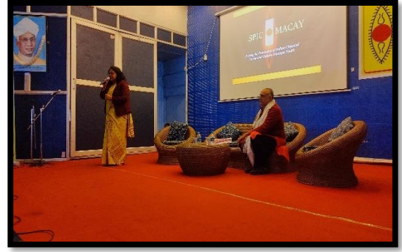
Welcome Speech by the Principal