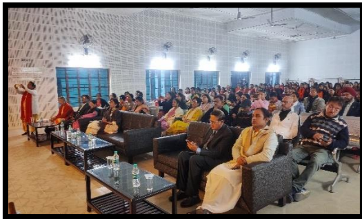
Audience in rapt attention