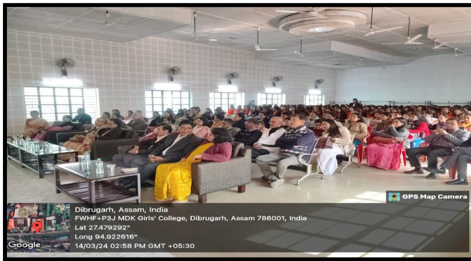
Members of the Audience